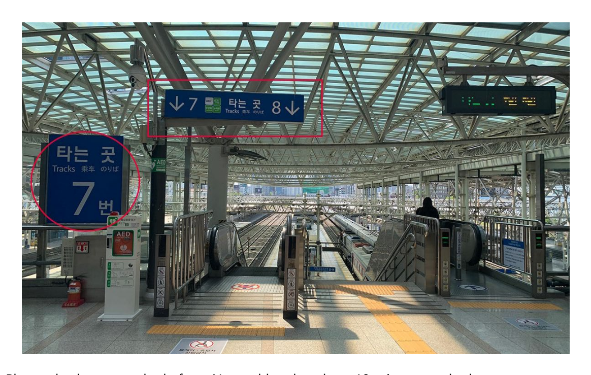
Please check your track platform No. and head to there 10 minutes at the latest.