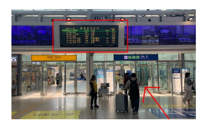
Inside the Seoul Station(KTX), you can check the status of your train via digital panels. (You can check the digital panels in Korean and English)